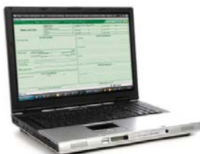
Sales Access Manager SM for Conceptual Selling ®