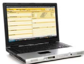
Sales Access Manager SM for Large Account Management Process ®