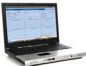
Sales Access Manager SM for Strategic Selling ®